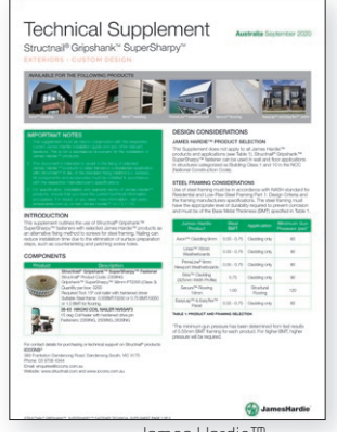
James Hardie<sup>™</sup> Technical Supplement