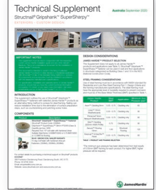
James Hardie<sup>™</sup> Technical Supplement